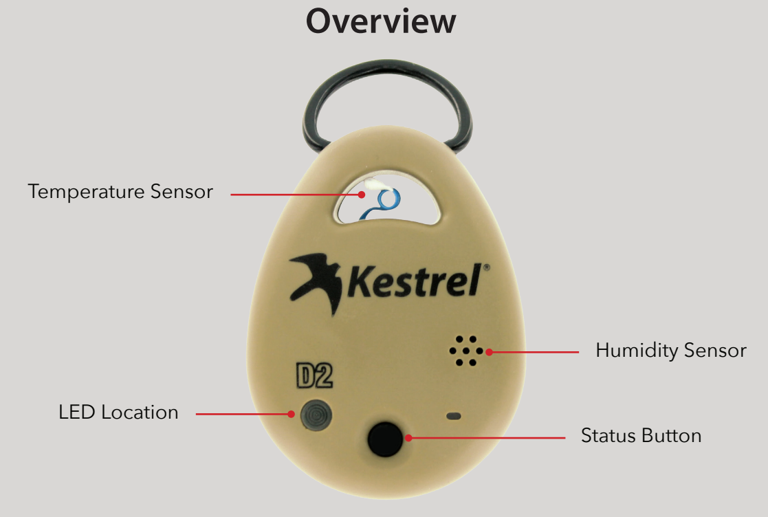
Figure 1: Overview