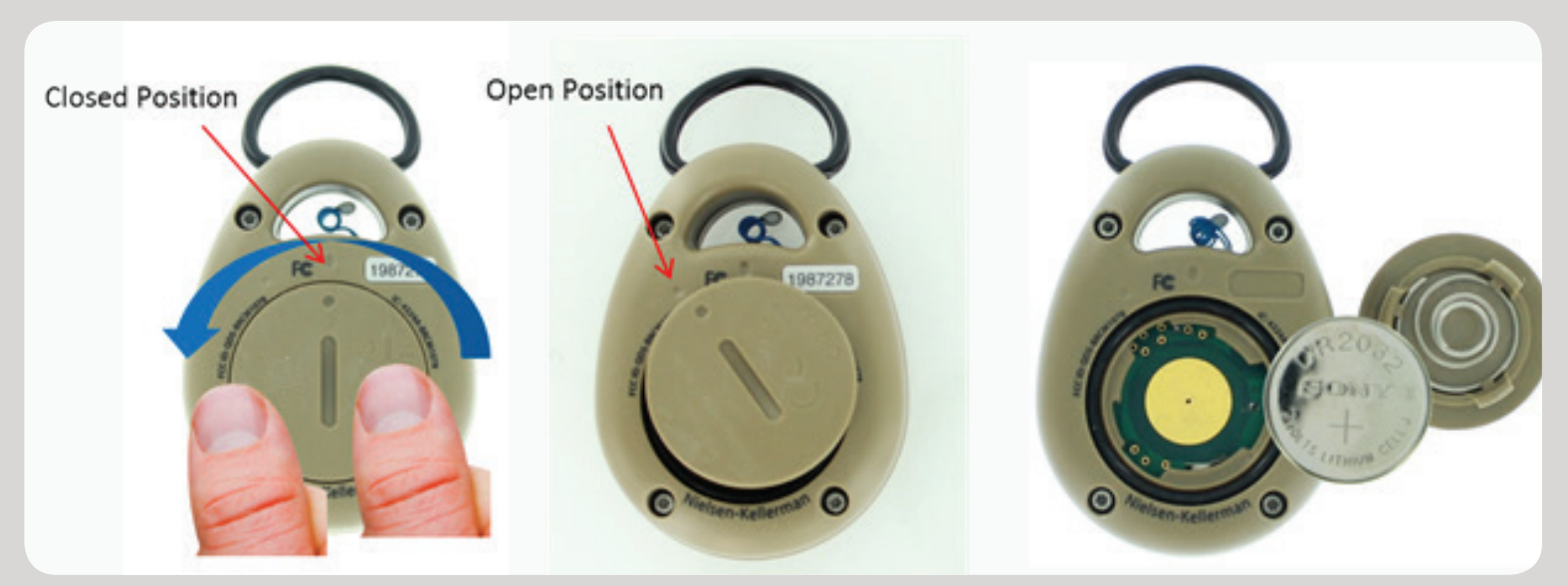
Figure 2: Battery Replacement

(Please note: After battery replacement, you MUST reconnect to the Kestrel Connect application to ensure time and date are updated for logging purposes.)